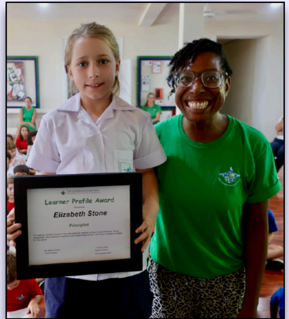
Libby (PYP 6) - Principled