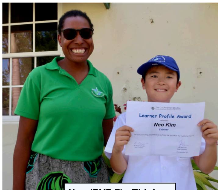
Neo (PYP 7) - Thinker