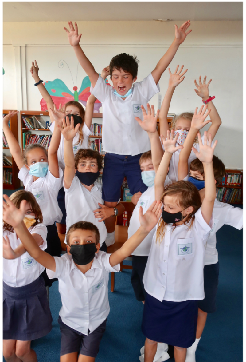
Last day of school in PYP 6 May 26 2022