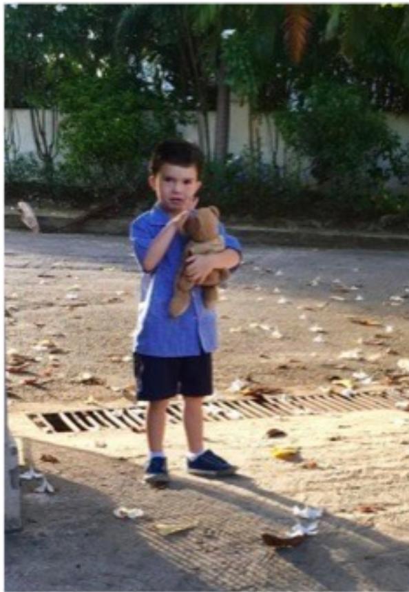
First day of school in PYP 2 September 6 2017

We wish them all the best in the next chapter of their journey as they relocate back to England.